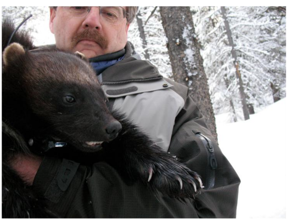
Above: F3, a young female wolverine from the Absaroka-Beartooth Project, in April of 2010

Peace Corps provided a unique experience even within conservation, though, because it allowed me two years to live and work in a community where I spoke the language and understood the culture. You don't get this chance anywhere else, not even through academia. I've subsequently worked with large international NGO's in other countries and I've been shocked by the lack of contextual understanding of Western 'experts.' I have a Master's degree from one of the world's leading environmental schools, but at heart I think that the lessons I learned in Kharkhorin - from